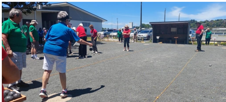
Joy in action

Had an enjoyable day, good morning tea & afternoon tea.