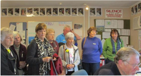
Mount Maunganui Life Saving

Coastguard – Mayday became an international distress call in 1923 and was made official in 1948. A senior radio officer at Croydon Airport, London came up with “ mayday ” from the French “ m'aider ” - help me.